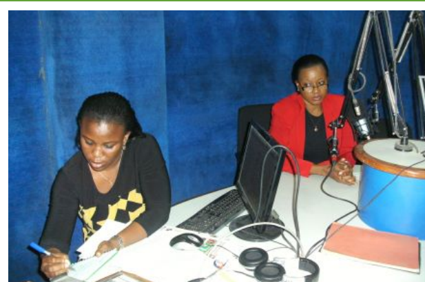
COPE CEO at Radio Continental