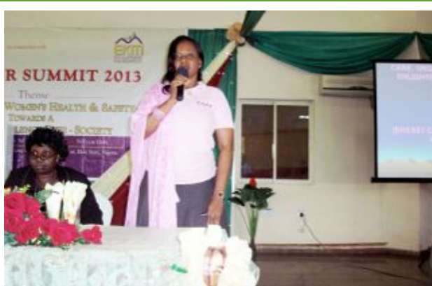
Ekiti State 3rd Gender Summit 2013