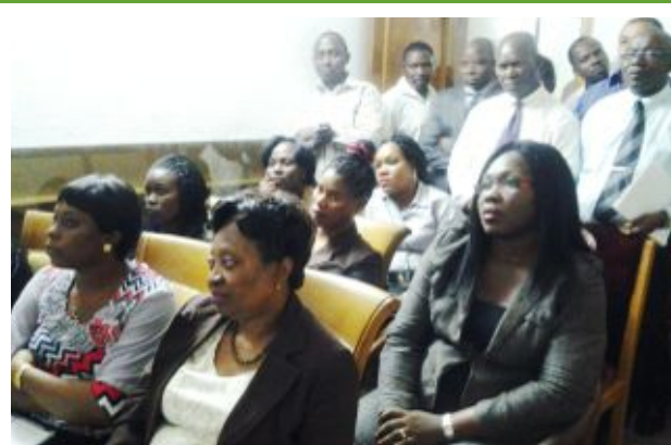
Breast Cancer Lecture at Broadband Technologies, Ikoyi Lagos.